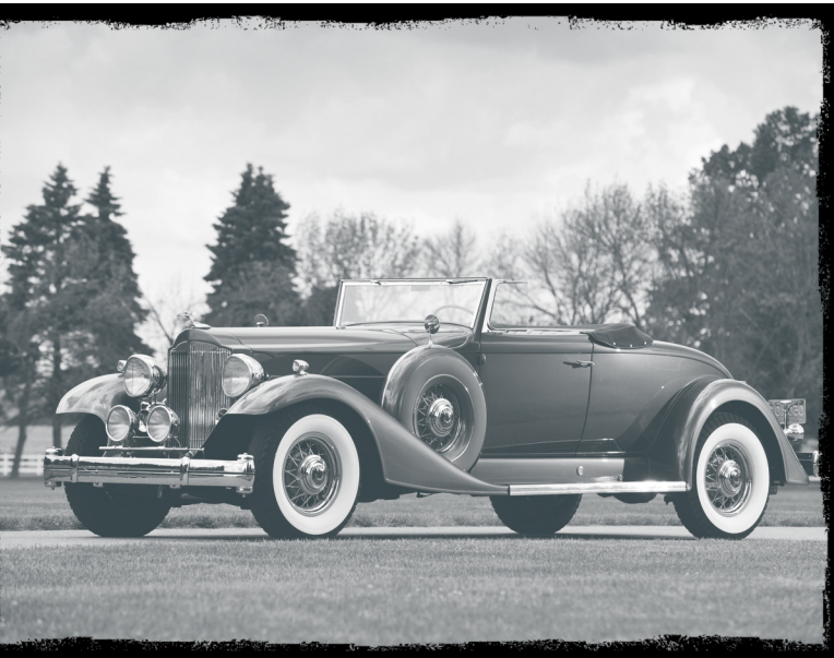
1933 Packard Twelve Convertible Coupe.

When hiring appraisers designated from the American Society of Appraisers (ASA), you can be confident that these professionals have been trained and tested in their specialty area, vetted for their experience and appraisal skills and that each has pledged to uphold the Society's ethical standards and the Appraisal Foundation's Uniform Standards of Professional Appraisal Practice. (USPAP), which are the generally accepted standards for professional appraisal practice in North America. ASA is the oldest and only major appraisal organization representing all appraisal specialists. The Society is known and respected around the world for providing the highest standards in all areas of ethics, professionalism, education and designation criteria.