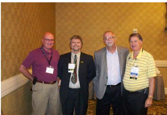
During a break at the RPC meeting.