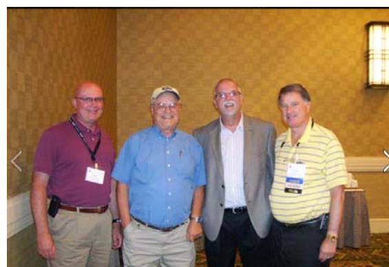
During a break at the RPC meeting